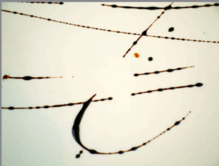
inZENso Compres® 2008