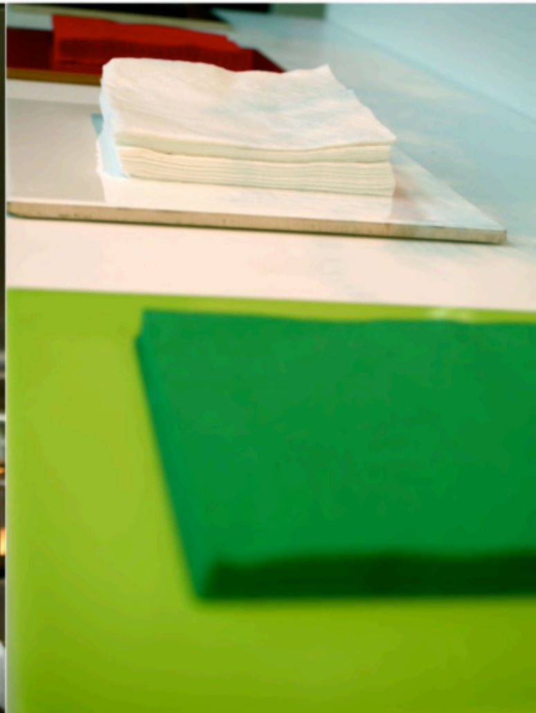
OUT of SIGHT B-Side Italian Food